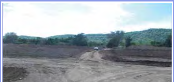
Six stabilisation sewer ponds are under construction to help facilitate the ever increasing waste management in Maamba - New sewer ponds under construction