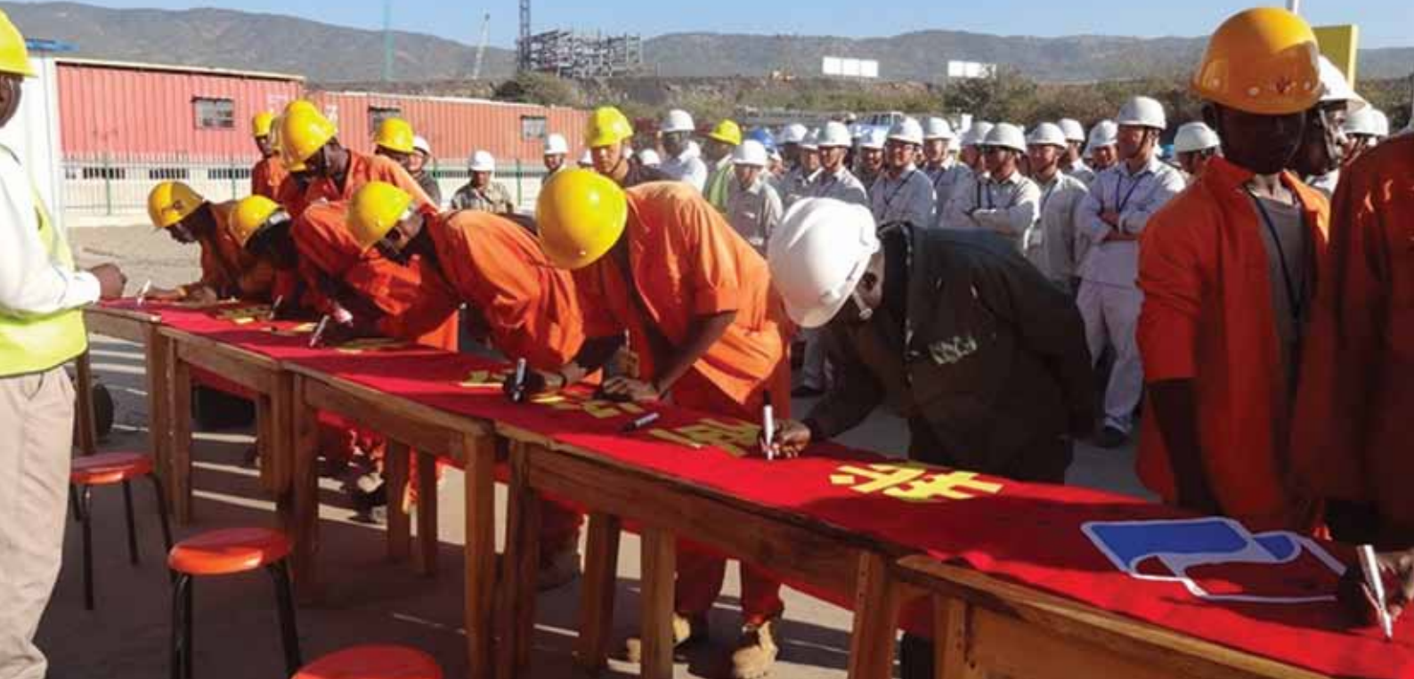
Contractors appending signatures after the speeches

The following shows the activities (projects) under CSR Sewage Pond