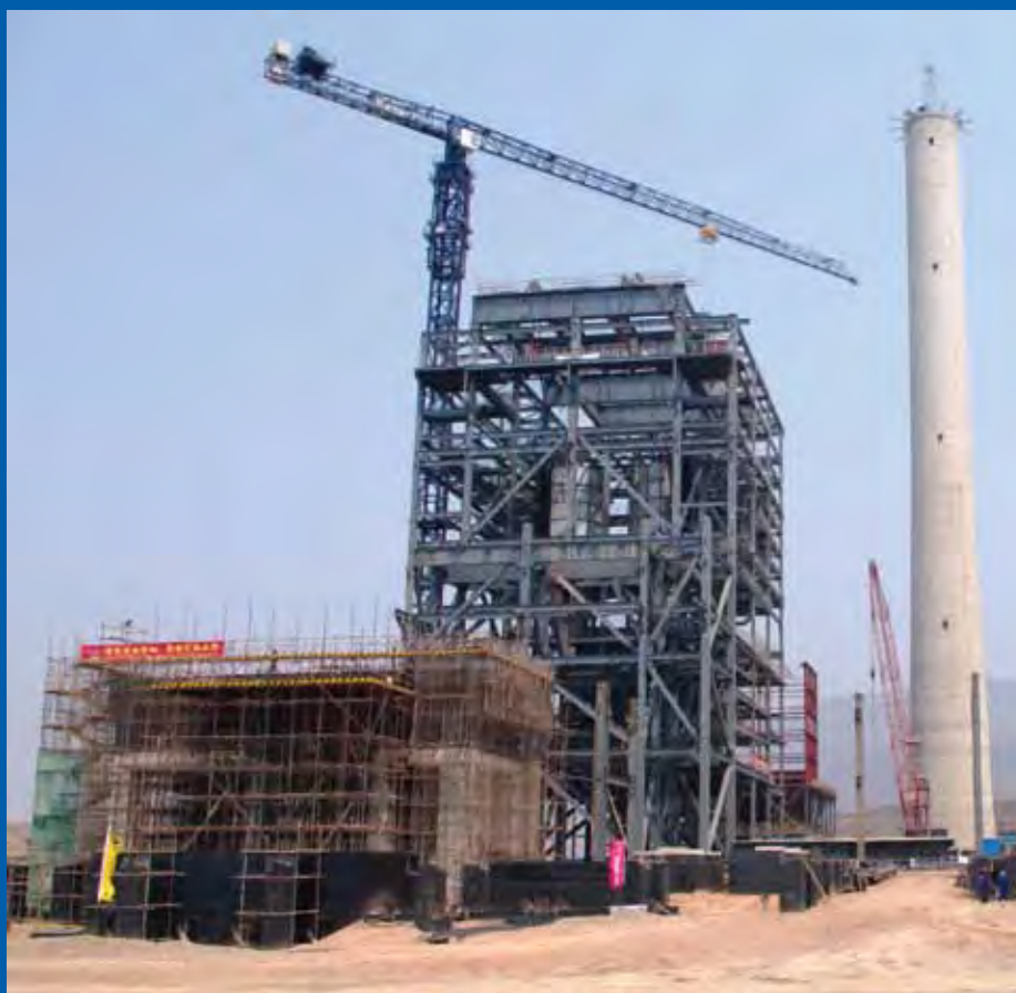
2 X 150 MW Power Plant under construction in Maamba, Zambia

Meanwhile, Heavy duty equipment have been mobilised to site for the water pipe line works and pipe line corridor bush clearing works are on course.