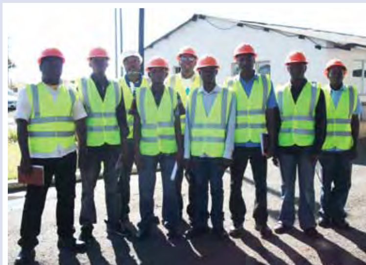
Some of the new engineers at the Power Plant

The programme is part of the process to add to government efforts in creating jobs for the Zambian people and this will boost the economic fortunes of Maamba town.