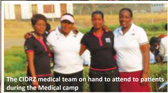
The CIDRZ medical team on hand to attend to patients during the Medical camp