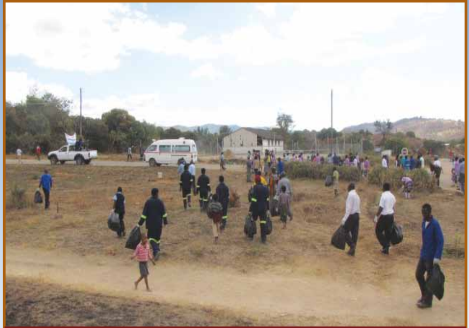
MCL employees and residents collecting garbage from the township

Objectives of new management at MCL include revival of coal mining activities with scientific, efficient and environmentally friendly operations. Having set up the CHPP, the company is now preparing to start the establishment of mine-mouth, coal