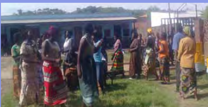
Women in Maamba at the market celebrating the donation of waste bins by MCL in collaboration with Wako Minerals

The company has procured garbage handling bins for the Maamba community. The bins have been placed in various corners and strategic locations of the township to ease the disposal of waste.