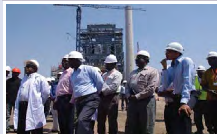
Mines Minister Hon. Christopher Yaluma (in white work suite) during the tour of the Maamba power plant recently