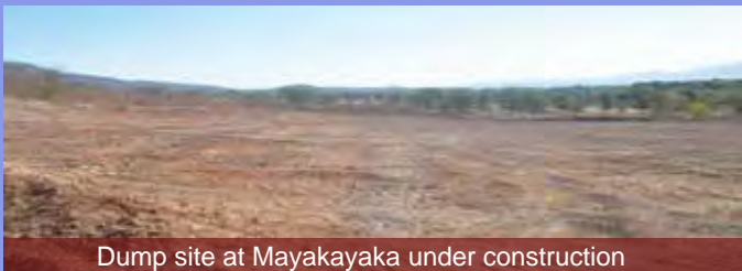
Dump site at Mayakayaka under construction

The following shows the activities (projects) under CSR Sewage Pond