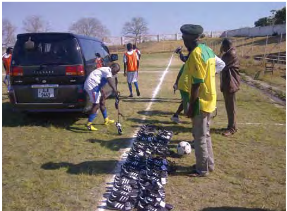
Football boots procured by MCL for ZAMCOAL Diggers