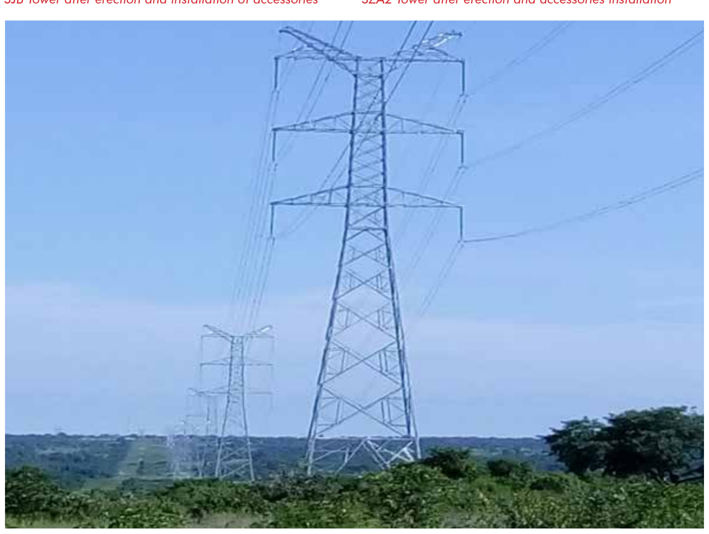
After conductor pulling and accessories installation between Towers G107-G94