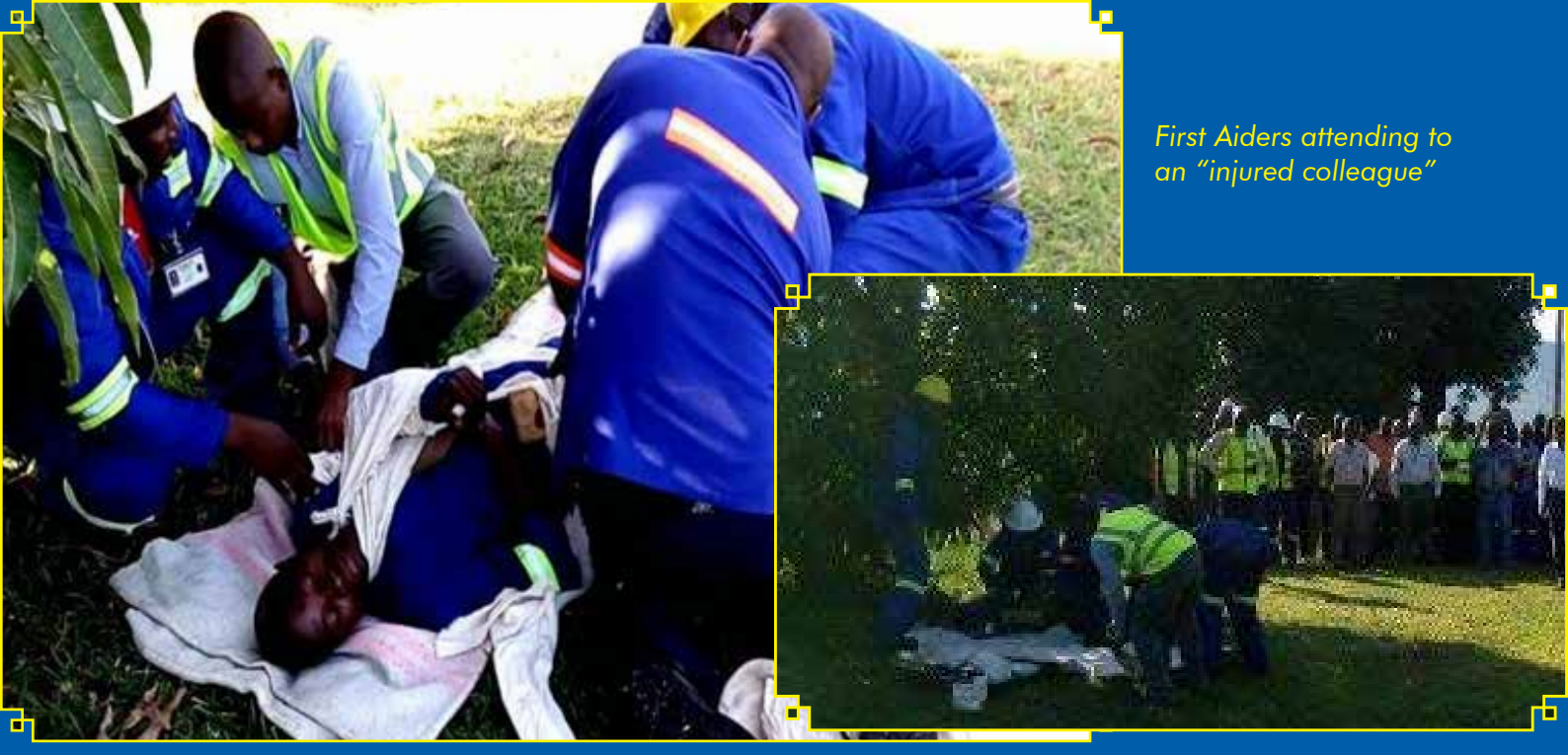
Staff members watch a First Aid demonstration lesson