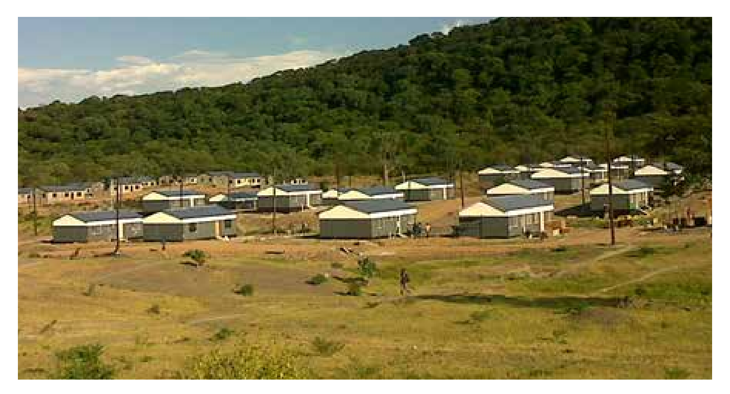
Houses for people affected by the project

The breakdown of houses being constructed is as follows: One bedroomed 28, two bedroomed 28 and 3 bedroomed 15 and 1 extra. The Project Affected Persons (PAPs) are constantly consulted in this project to ensure that they are fully satisfied.