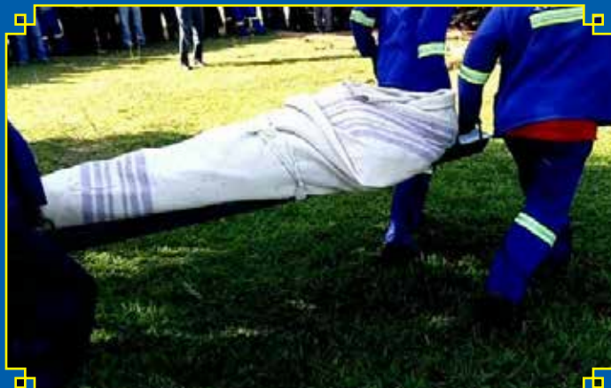
First Aiders helping an "injured colleague"