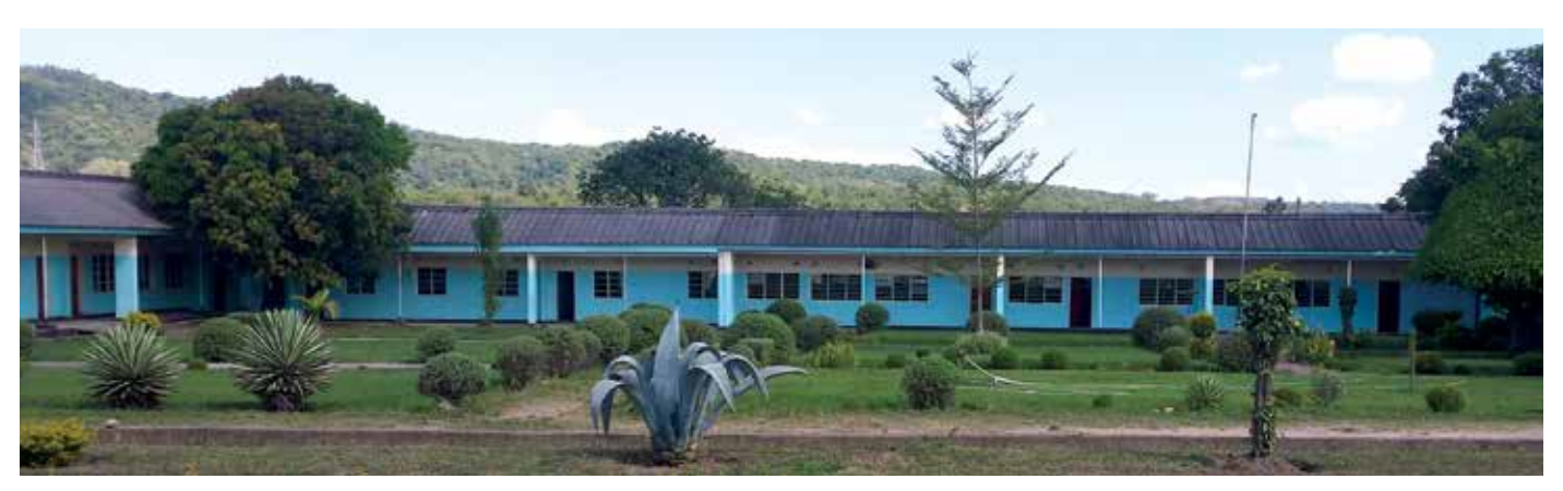
Maamba Private School

The performance of the school has been exceptional at Grade 7 and 9 national examinational levels.