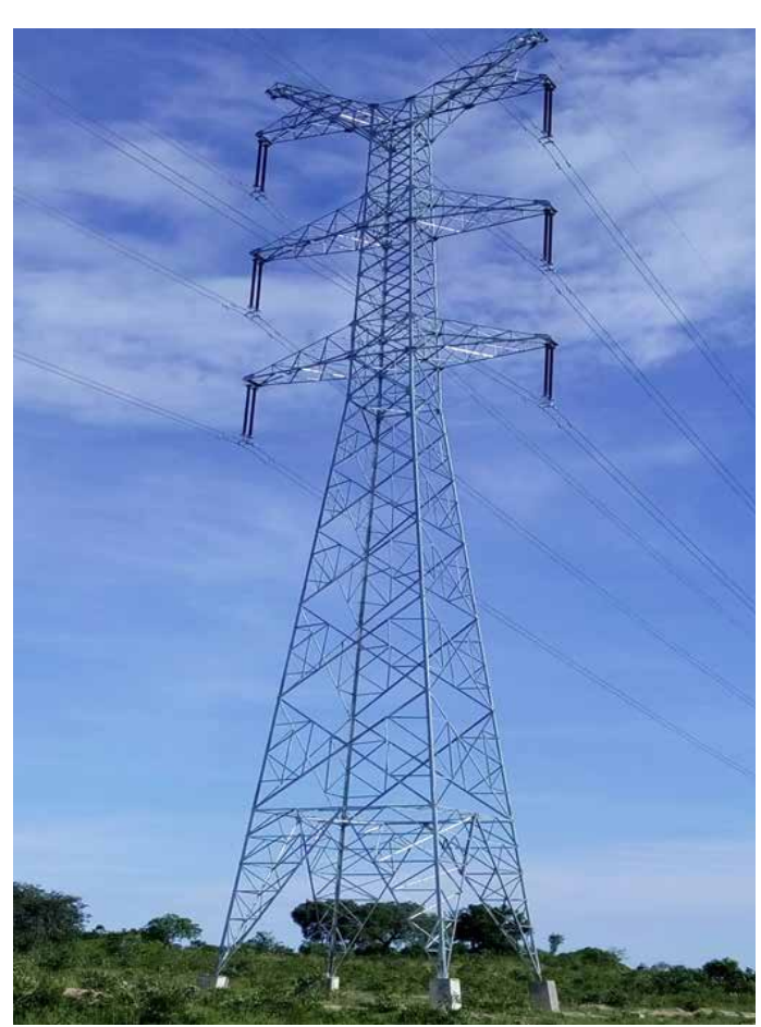
SZA2 Tower after erection and accessories installation